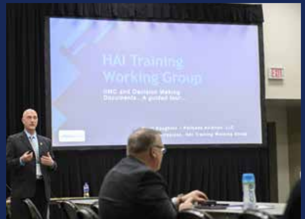
HAI working groups meet several times a year, with one meeting taking place at HAI HELI-EXPO to allow interested stakeholders to join the discussions.