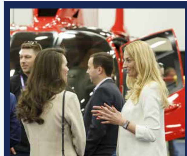
HAI events connect the global vertical aviation industry.