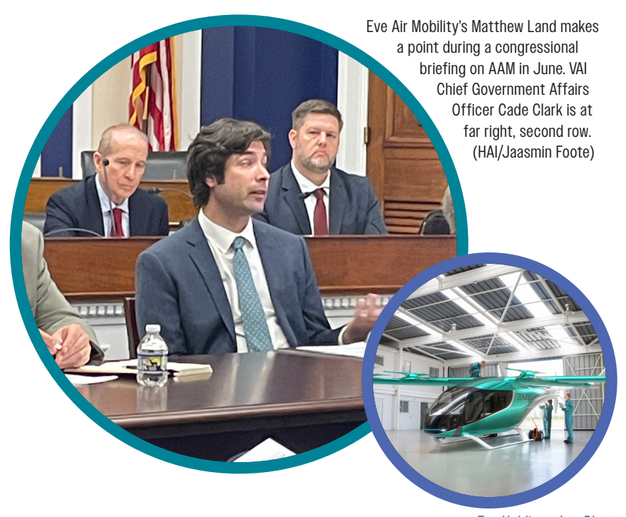
Eve Holdings, Inc. Photo